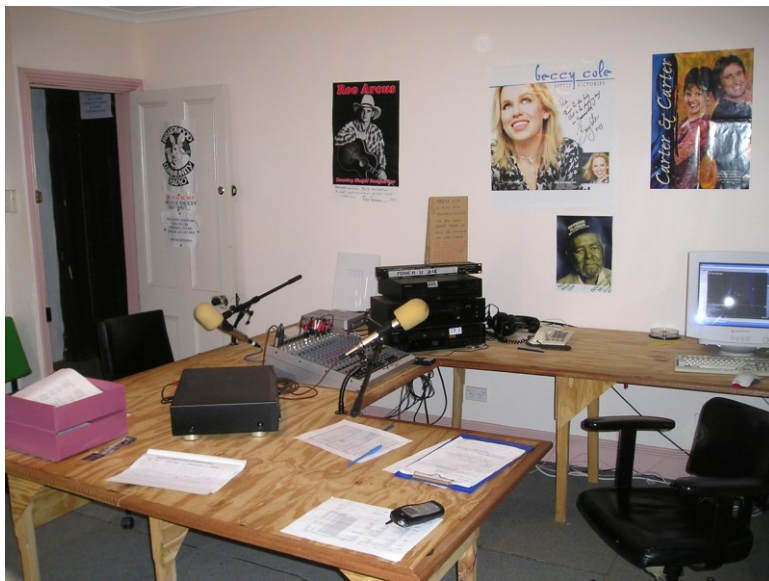
Braidwood FM (original) studios, 2003

Everything went smoothly for the rest of the day, and in those early days of test broadcasting the station was on air from around 8am to 8pm, as there was no computerisation, and only a handful of presenters.