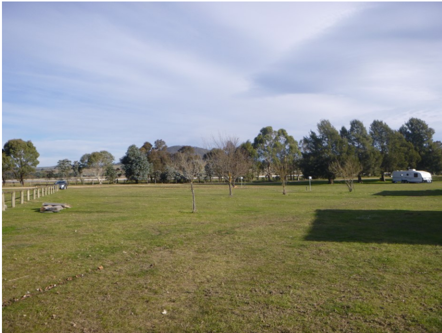
Braidwood Showground – proposed site for Braidwood Community Radio

A mutually agreeable location was agreed upon within the Showground site and Rob approached Palerang Council to discuss the project. This was done as the Braidwood Show Society is a 355 committee that reports to Palerang Council, and there are heritage issues with the showground site.