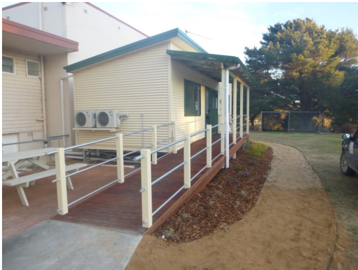
New 2BRW Studios 2016 at Braidwood Servicemen's Club