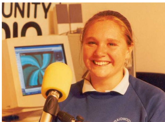
Vanessa Williams, presenter, 2004