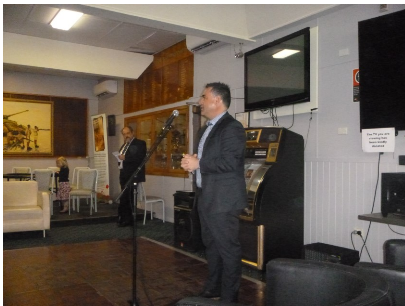
John Barilaro, National Party member for Eden-Monaro at the Open Day ceremony held at the Braidwood Servicemen's Club on Friday the 17 th June 2016 for Braidwood FM's new studios.