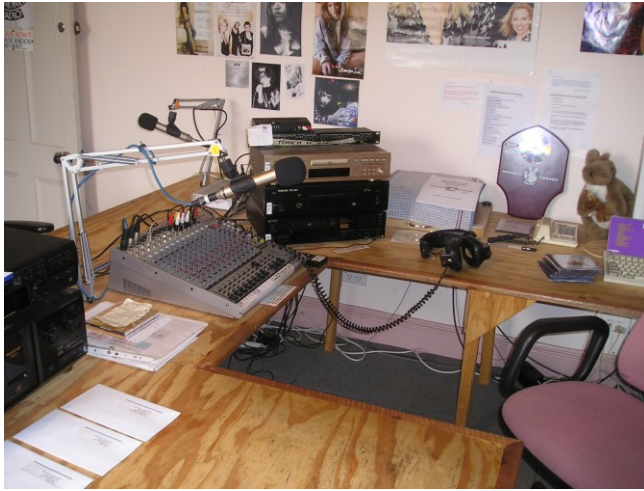
Braidwood FM studio, 2005