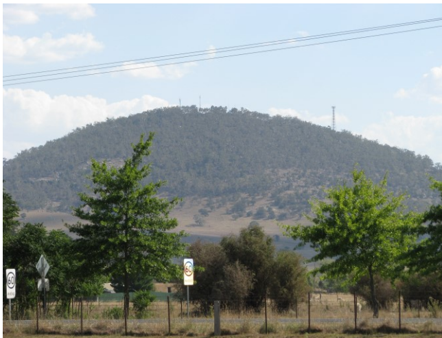
Mt. Gillamatong where Braidwood FM's broadcast transmitter is located.