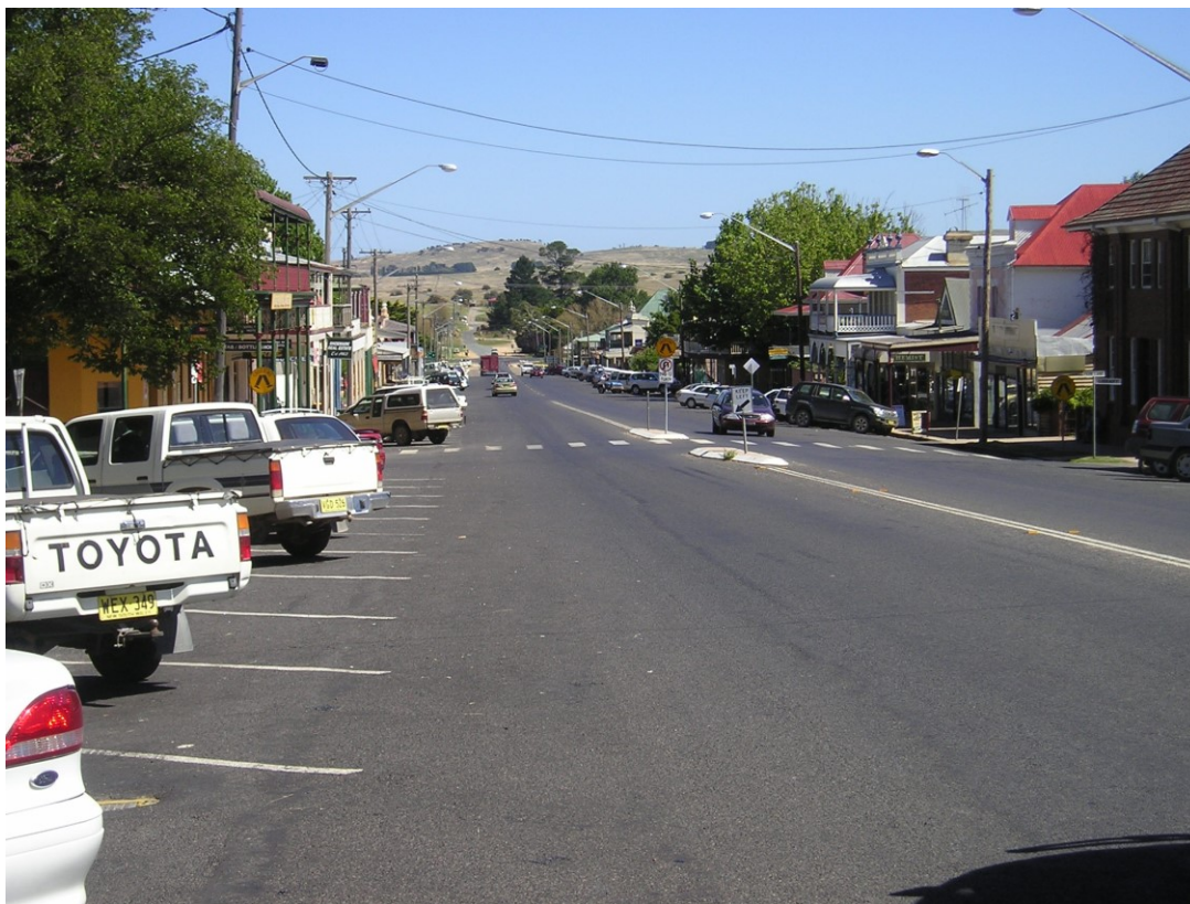
Wallace Street, Braidwood NSW