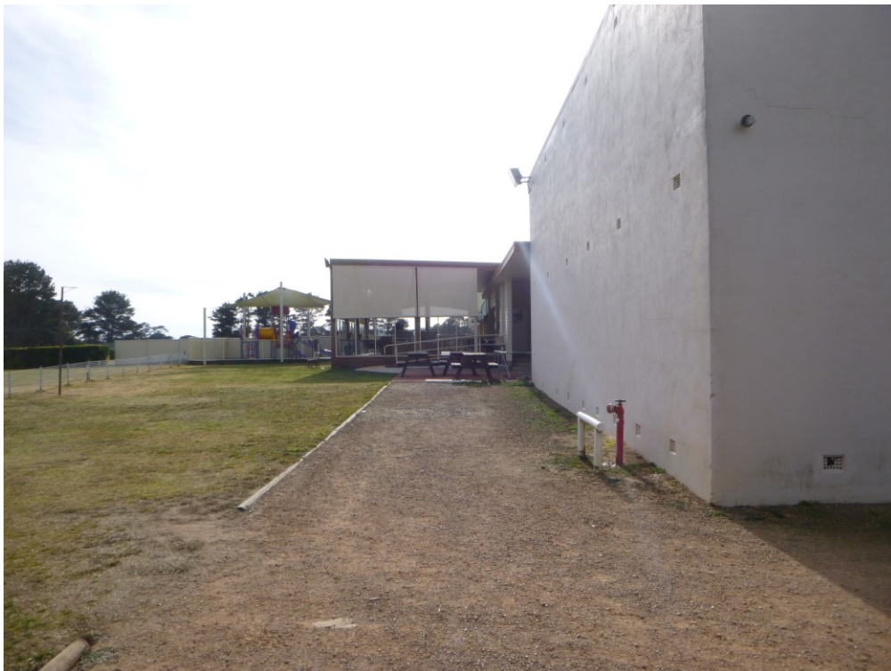
Site for Braidwood FM's new studios 2016, behind the squash court at Braidwood Servicemen's Club