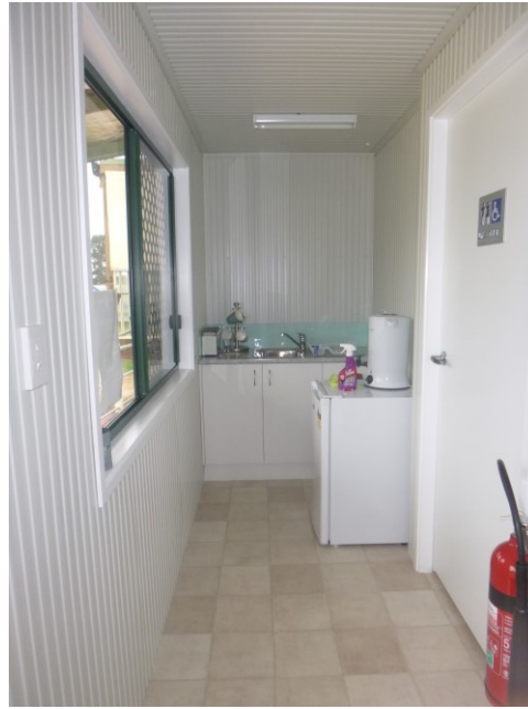
New 2BRW Studios 2016 at Braidwood Servicemen's Club