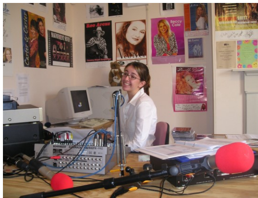
Mistin, Singer/ songwriter/ presenter, 2005