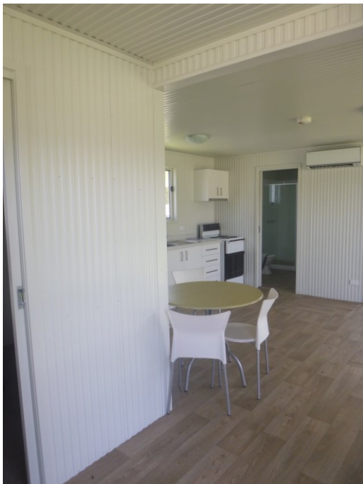
Basic design of the proposed new Braidwood Radio studios - 2015