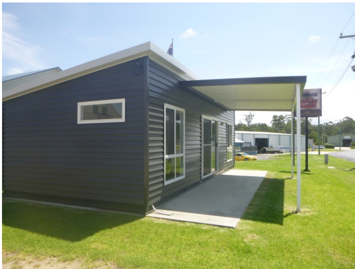
Basic design of the proposed new Braidwood Radio studios - 2015

Over several months Rob had discussions with Mordek commencing with a basic floor plan and refining it till it included disabled toilets, doorways and entrance ramps, as these were requirements of Palerang Council. Rob also visited Mordek's manufacturing site at Moruya to see the buildings first hand.